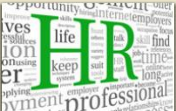
Business 106 Human Resource Management (31 video lessons)