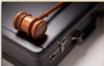
Business 103 Introductory Business Law (147 video lessons)