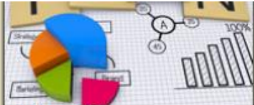
Business 100 Intro to Business (185 video lessons)