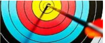
Business 102 Principles of Marketing (83 video lessons)