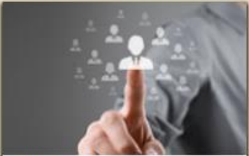
Business 111 Principles of Supervision (45 video lessons)