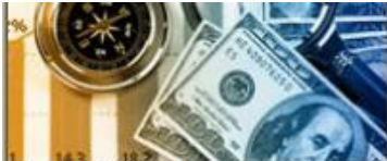
Accounting 101 Financial Accounting (11 video lessons)