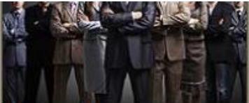
Business 101 Principles of Management (135 video lessons)