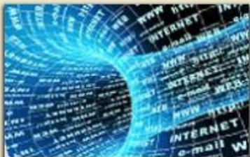
Business 104 Information Systems and Computer Applications (55 video lessons)