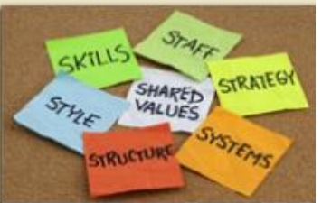
Business 107 Organizational Behavior (205 video lessons)