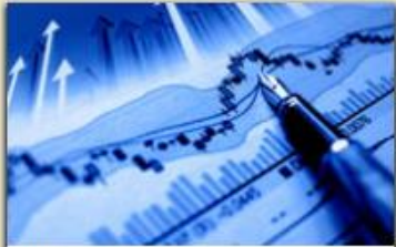
Business 110 Business Math (34 video lessons)