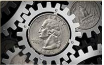
Economics 102 Macroeconomics (88 video lessons)