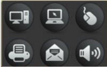
Business 109 Intro to Computing (31 video lessons)